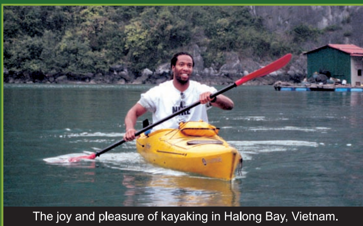
The joy and pleasure of kayaking in Halong Bay, Vietnam.

The eight day tour includes four and five star accommodation (including two nights on the Junkboat), all meals, local bilingual guides, kayaking and all sightseeing entrance fees as detailed in the itinerary.