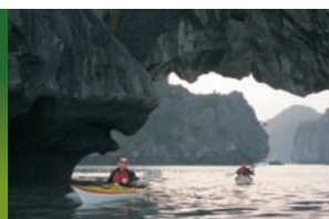
Kayaking in Halong Bay