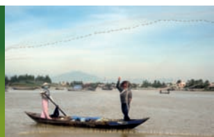
Fishing on the Hoai River in HoiAn