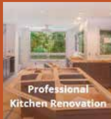
Professional Kitchen Renovation

Vogue Bathrooms and Kitchens is a specialist design and renovation company in Brisbane. With over 25 years experience, our reputation has been built on quality, professionalism and reliability. Every week, we provide exquisite and unsurpassed transformations individualised to each client's needs.