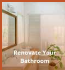
Renovate Your Bathroom