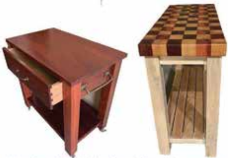
Handcrafted Kitchen Island Benches

Phone (07) 3390 5673 admin@intowoodworks.com.au www.intowoodworks.com.au