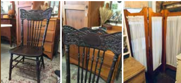
German Oak Spindle Back Chairs

Unique and Interesting Pieces To Suit Your Home Décor