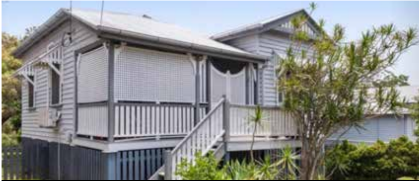
18 Beatrice Street, Bardon. Sold ...Private Sale/Treaty