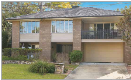
No. 19 Fenchurch St, Fig Tree Pocket 4 Bedroom, 2 Bathroom & double lockup garage.