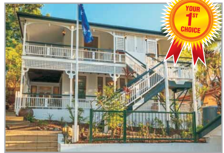
39 Dudley Street, Bardon SOLD for $1.175M

Result: healthy competition from buyers to secure a contract. The market favours sellers right now! Cash in on the opportunity and list your property today. Call Jeff Smith for a free market appraisal.